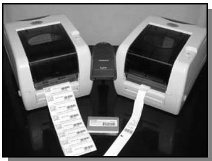
Label Station & Wristband Station

Easy To Afford ~ Are you tired of paying the high supply costs of your laser printed labels & wristbands? Looking to eliminate the maintenance costs of your old card based system? Patient ID XPress™ is both affordable to purchase and operate.